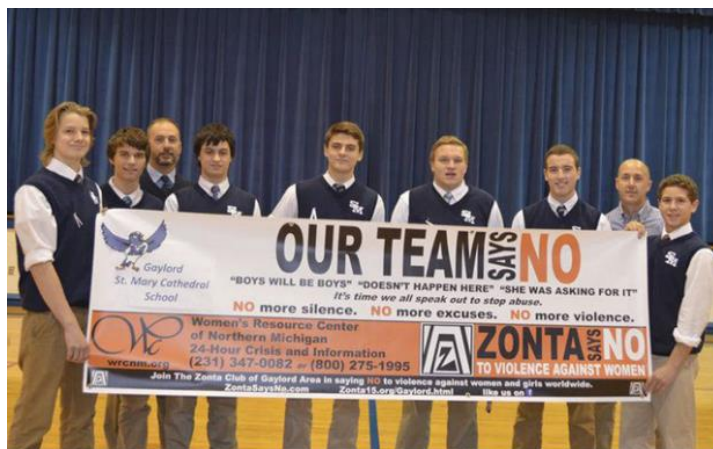
GAYLORD AREA – CATEGORY 2 OUR TEAM SAYS NO TO VIOLENCE AGAINST WOMEN