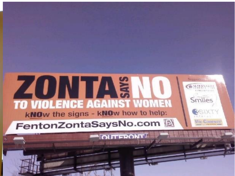
FENTON AREA – CATEGORY 2 VAW HIGHWAY BILLBOARD CAMPAIGN