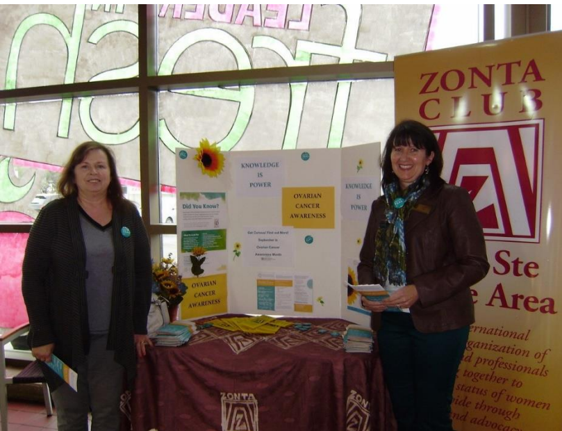
SAULT STE. MARIE – CATEGORY 1 OVARIAN CANCER AWARENESS

After careful consideration, the evaluating committee has selected the following 3 district finalists to send on to the next level of consideration and to display at international convention in Nice this summer: