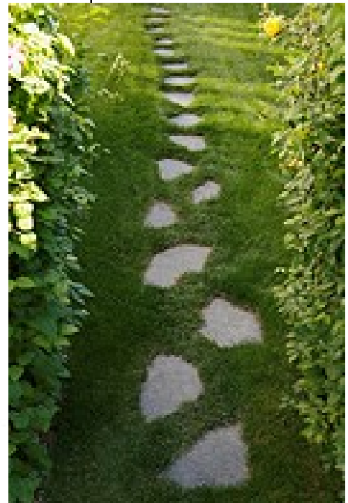
The Zonta Club of Midland provides the stepping stones for young women in our area to achieve their goals and make an impact on the future.