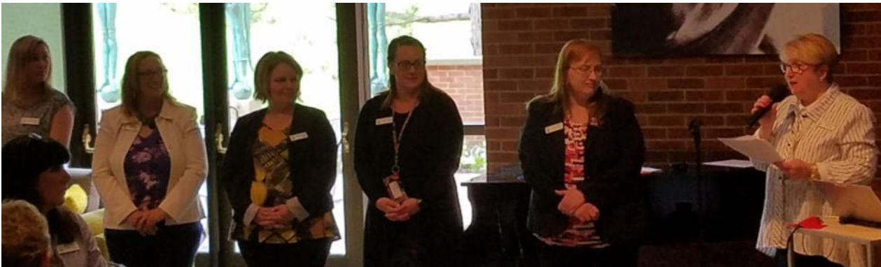
Welcoming the new 2017-18 Board and Committee Chairs