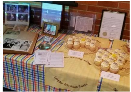
Celebrating Zonta Club of Midland's 70 Birthday!